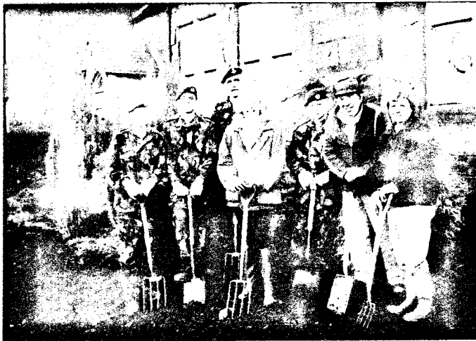
The "Hit Squad"